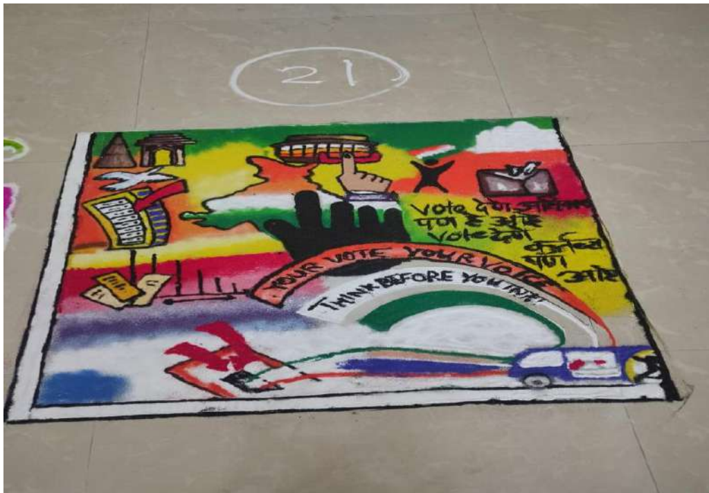
Winner Participant in voter awareness -Rangoli