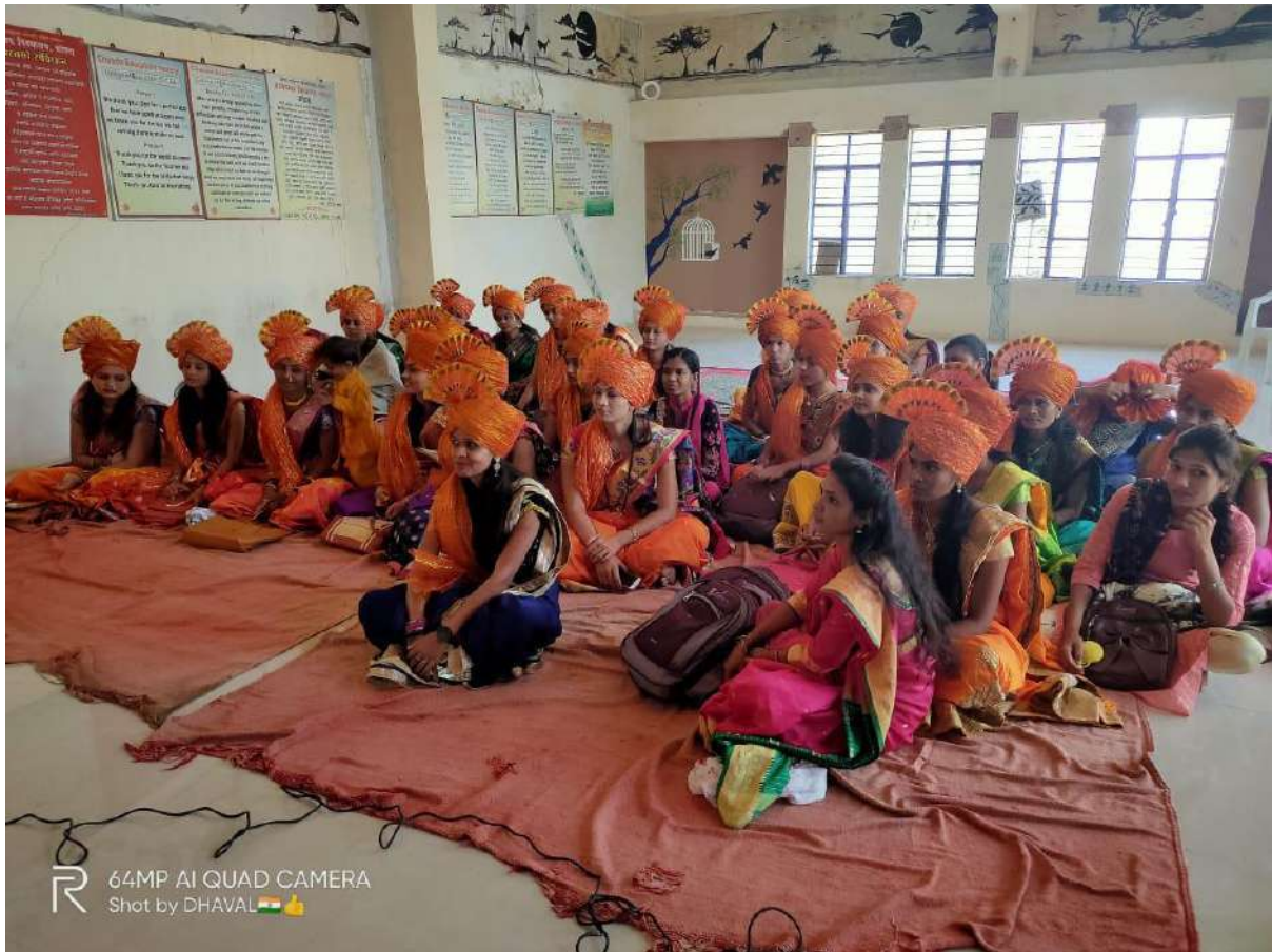
World Yoga Day